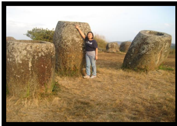
PLAIN OF JARS, XIENG KHOUANG PROVINCE

DECEMBER 15 10:05 LV: Siem Reap Monday 11:25 AR: Pakse PM Pakse Worley Engelken Library ON: CHAMPASAK GRAND HOTEL Lao-Nippon Bridge, Mekong River P.O. Box 419, Pakse, Lao PDR PH: 856 31 2551118 FAX: 856 31 2551119 E-Mail: info@champasakgrand.com WEBSITE: www.champasakgrand.com