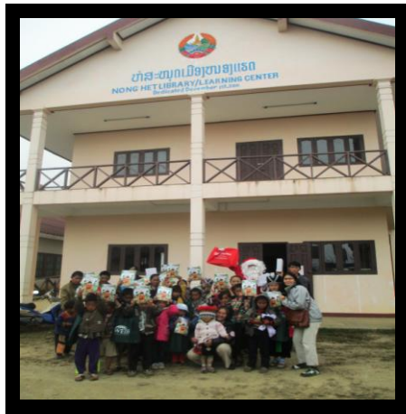
CLI HMONG KIDS & DELEGATE, NONG HET